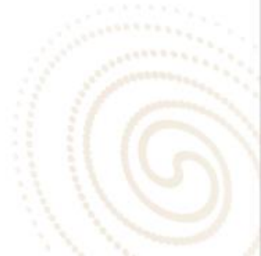
< Cover of the English version >